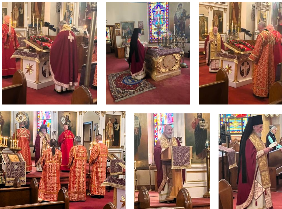
The Veneration of the Cross