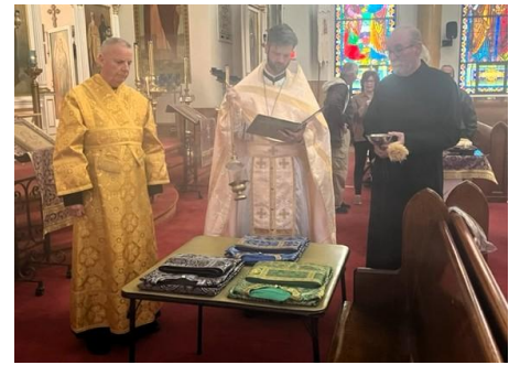
(Blessing of Robes)