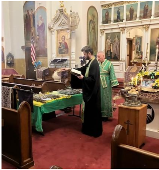
(Blessing Palms, Pussy Willows)