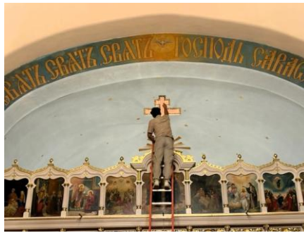
(Israel Prevail changing cross lights)